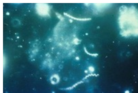
Darkfield micrograph of Treponema pallidum .