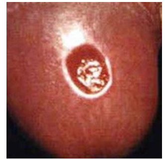
Example of a primary syphilis sore.