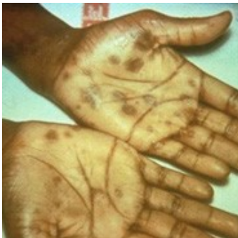
Secondary rash from syphilis on palms of hands.

Symptoms of syphilis in adults vary by stage: